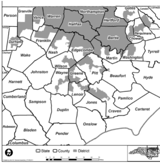
Cooper Invalidated District