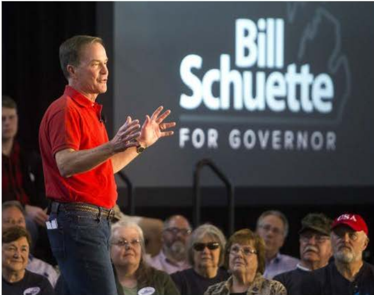
Michigan Attorney General Bill Schuette of Midland announces his gubernatorial campaign Tuesday, Sept. 12, 2017, at the Midland County Fairgrounds in Midland.

Schuette's two predecessors — Republican Attorney General Mike Cox and Democratic Attorney General Jennifer Granholm — did not have these positions, though Cox had a director of constituent relations near the end of his eight years in office, state records show.